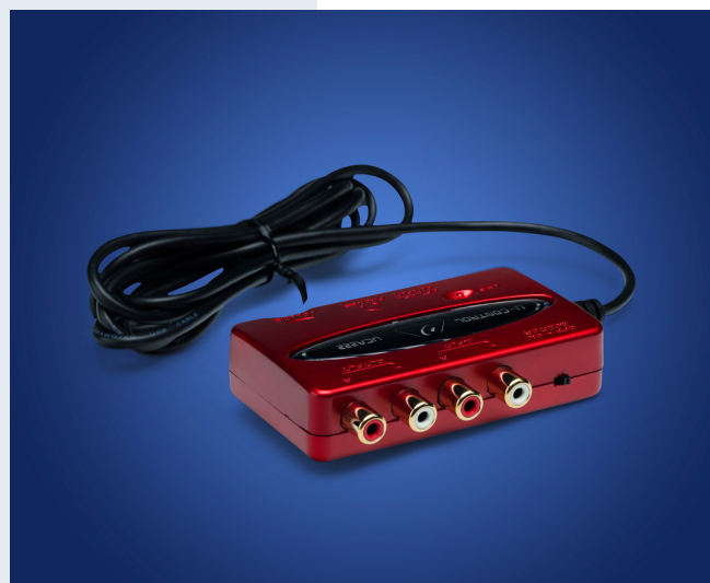
external USB audio interface

Automatic recovery after power or network failures make it an excellent and reliable network device.