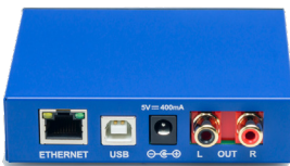
Lisa Compact backside

It can be used for streaming with or without backup from SD card as well as through the "rock solid" store-and-forward mechanism. The Lisa delivers targeted music, messaging and advertisements for music providers and retailers.