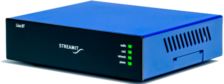
Lisa Compact BT